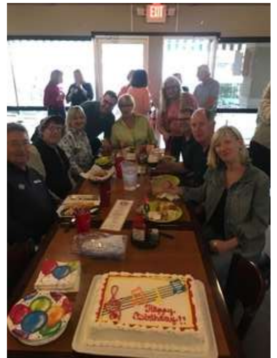
May Birthday Party