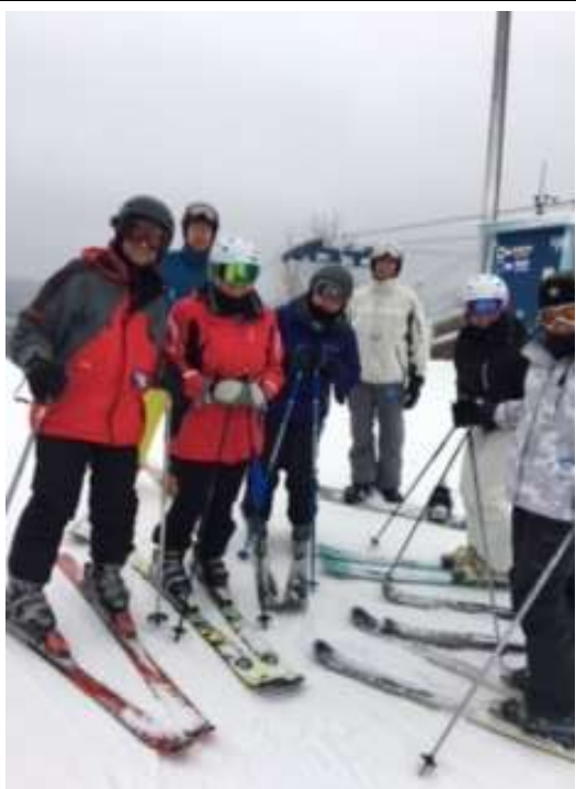
Mt Holly Ski Day