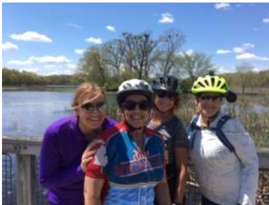
Kensington Bike Ride